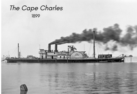
The Cape Charles 1899