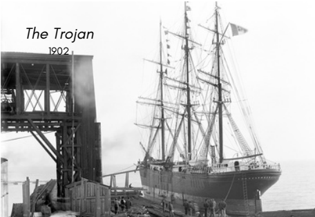
The Trojan 1902

We offer a competitive advantage for both vessel and cargo movement, featuring a short 18-mile transit to open Gulf waters, a 90-minute channel, a quick 5-mile drive to Interstate 10, and Class 1 rail service, with no delay due to traffic or congestion.